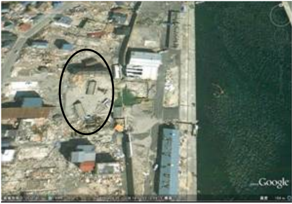
Figure-20 Damaged Tide Wall (No. 3)