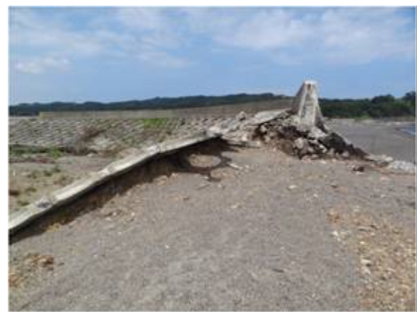
Figure-4 Section of Tide Wall (No. 1)