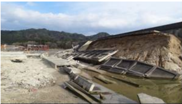
Figure-14 Damage to Tide Wall (No. 4)