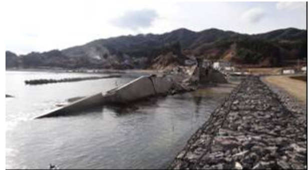
Figure-15 Damage to Tide Wall (No. 4)