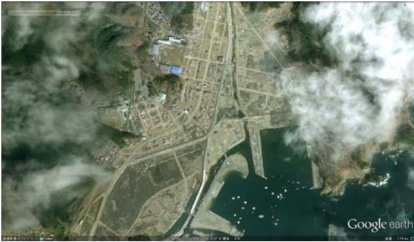
Figure-6 Aerial Photograph of Coast at Taro Fishery Port (No. 2)