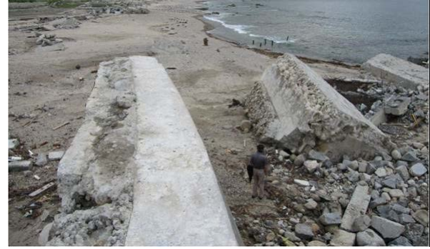
Figure-13 Damage to Tide Wall (No. 8)

Figure-12 shows an aerial photograph of the coast at Yoshihama Agricultural Field (No. 8) after the tsunami. The white line in the photograph indicates the location of the tide wall before the disaster, its total length being around 0.6 km. The wall collapsed toward the sea side along its entire length. The seaward collapse of the main body of the wall can be