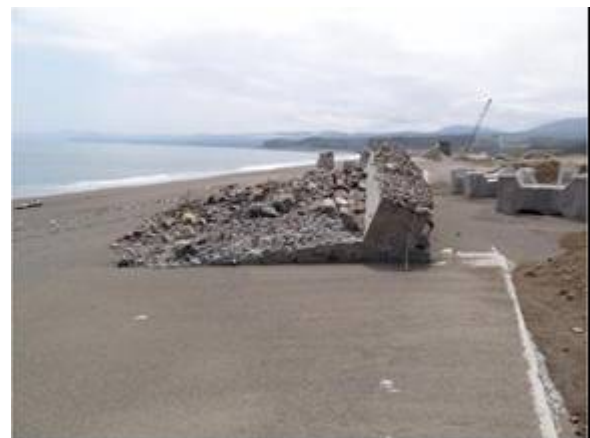
Figure-5 Collapsed Tide Wall (No. 1)