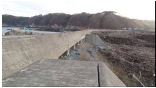
Figure-7 Damaged Tide Wall (South Side) (No. 2)