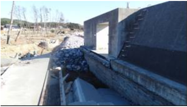
Figure-25 Damage to Tide Wall (No. 9)

tide walls without back slope protection are therefore considered to be collapse due to spilling waves, or scouring caused by spilling waves.