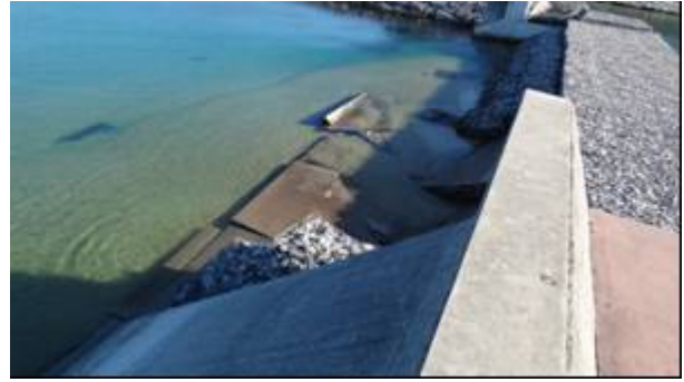
Figure-17 Damage to Tide Wall (No. 10)