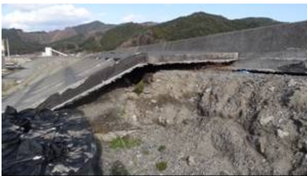
Figure-10 Damage to Tide Wall (No. 6)