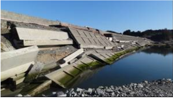
Figure-16 Damage to Tide Wall (No. 10)