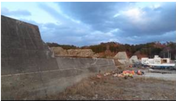
Figure-8 Damaged Tide Wall (North Side) (No. 2)