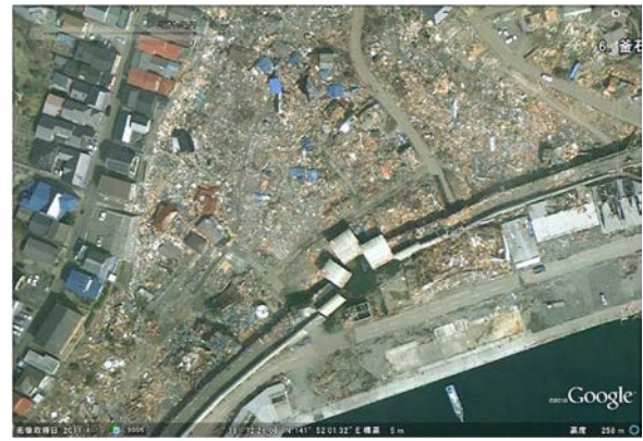
Figure-21 Aerial Photograph of Coast at Kojirahama Fishery Port (No. 7)