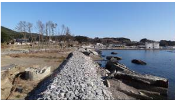
Figure-24 Damage to Tide Wall (No. 9)

Figure-21 shows an aerial photograph of the coast at Kojirahama Fishery Port (No. 7) after the disaster. The total length of the tide wall in this area is 0.6 km. The four rectangular blocks in the center of the photograph indicate the location of the damaged section of the wall and the block positions show that the tide wall collapsed or leaned over toward the land side. The damage is shown in Figure-22. The soil at the rear side of the collapsed tide wall has