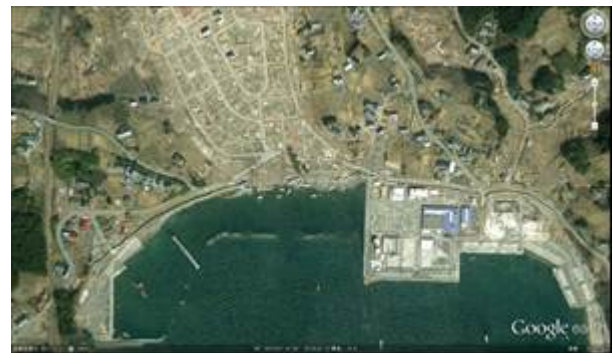
Figure-23 Aerial Photograph of Coast at Kadonohama Fishery Port (No. 9)