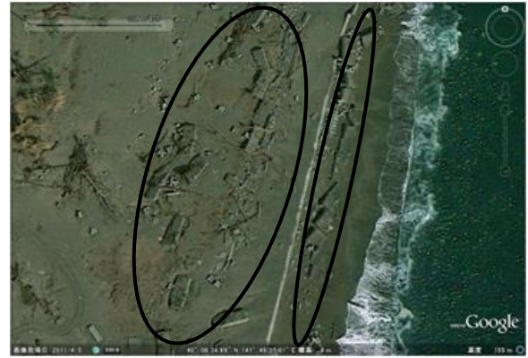
Figure-3 Aerial Photograph of Tofugaura Coast (No. 1)

Figure-3 shows an aerial photograph of the severely damaged Tofugaura Coast area ( No. 1 ). The slightly inclined vertical white line falling a little to the right of the photograph's center indicates that a concrete foundation and concrete superstructures are scattered on both the sea and land sides. A section of the damaged tide wall is shown in Figure-4 . There is sea sand inside the wall's structure. Figure-5 shows the collapsed tide wall. In this area, the sea side slope, or the front side slope, of the tide wall has collapsed toward the sea, the concrete blocks which protected the back slope have fallen towards the land side, and the infill sand has flowed out. This damage suggests that spilling waves first knocked down the concrete blocks and scoured the infill sand, the backrush then causing the front slope to fall down.