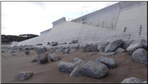
Figure-18 Tide Wall which Did Not Collapse (No. 1)