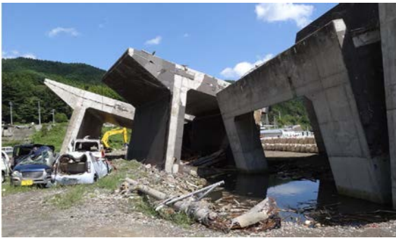
Figure-22 Damage to Tide Wall (No. 7)