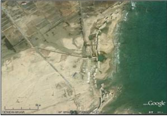
Figure-12 Aerial Photograph of Coast at Yoshihama Agricultural Field (No. 8)