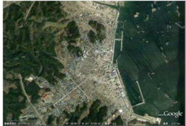
Figure-19 Aerial Photograph of Coast at Yamada Fishery Port (No. 3)

been constructed. The back slope of the wall was lost and part of the infill sand washed out, but the tide wall itself was saved from collapse, as shown in Figure-18 . This wall is known to have been constructed at a different time from the other structures. Since we believe that this tide wall can provide valuable information on how to protect tide walls from future tsunami disasters, we are currently studying its details.