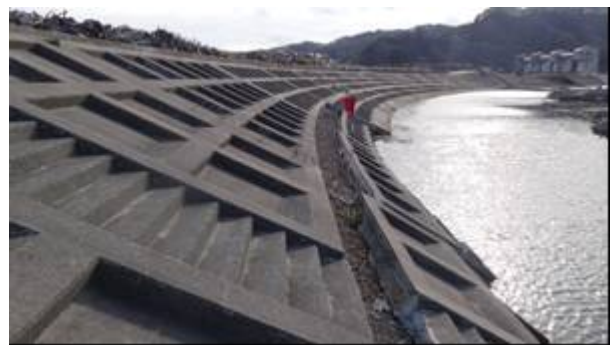
Figure-11 Damage to Tide Wall (No. 6)

shore side tide walls. The southern parts of the tide walls had the surface of the back slopes torn off and the infill sand washed out, as shown in Figure-7 . In contrast, their northern parts suffered more devastating damage. Figure-8 shows the damage to the northern part photographed from the sea side. The concrete blocks of the front side slope have been knocked down and the infill sand washed out. Only the concrete which supported the front slope