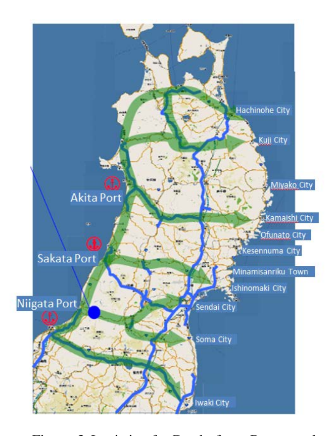
Figure 3 Logistics fo Goods from Ports on the Japan Sea (left) to Ports on the Pacific Side (right)

Figure 3 illustrates that unaffected ports on the Japan Sea side operated as backups, taking over the logistical functions of affected ports on the Pacific side. Because it takes anywhere from a few months to a few years to restore damaged ports, it is essential to develop a backup system through cooperation among ports.