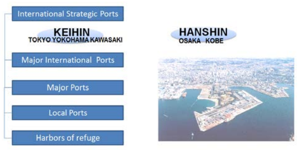
Refuge to small craft in case of a storm and are not used for the loading and uploading of cargo or boarding of passengers under normal circumstances

under the supervision of the General Headquarters of the Allied Powers in Occupied Japan (GHQ) in 1950. Table 2 describes the division of roles between the national government and port authorities based on the Law. The national government is not directly involved in port management, confining itself to mandating basic policies for port construction and management or technological standards for facilities. Port management is entrusted to port authorities (local governments).