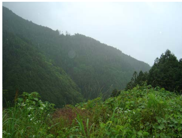
Figure 2 A view from mountains of Kunitomo

inorganic chemistry used. The scene of tea bushes growing is very different from ones seen in Uji, Kyoto, and Shizuoka, which are famous tea growing areas in Japan.