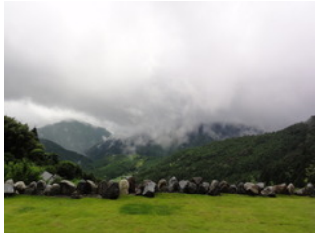
Figure 6 A view from the cottage

“Yama-gyo” concept makes us to understand this kind of possibilities as well.