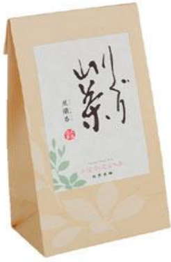
Figure 5 The Package