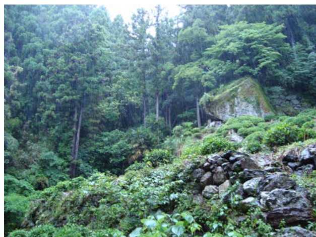
Figure 3 Tea bushes of Kunitomo

Teas from these forests and mountains are “Yama-cha”, which means “naturally grown tea in forests and mountains. “Yama-cha” has very unique aroma and flavors. There are some conditions that grow good tea i.e., lots of rainfalls, but good drainage, lots of sunshine, but fog that produce ultra violet...these conditions give tender tea leaves for good aroma. Kochi Prefecture has many mountainous areas with these conditions