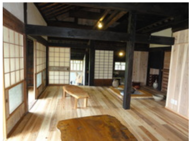
Figure 7 the cottage