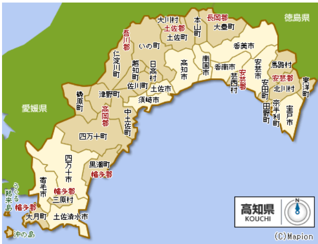
Figure 1 Kochi Prefecture

A case in this paper is on a construction company based in Ino area in Kochi prefecture. The company, that has been facing serious issues such as recession of construction industry due to a huge budget cut of the local public sector, is successful in an entirely new business, which is tea business. The company is Kunitomo Shoji K.K.(Kunitomo hereafter), which was established back in 1971, is located in typical mountainous area.