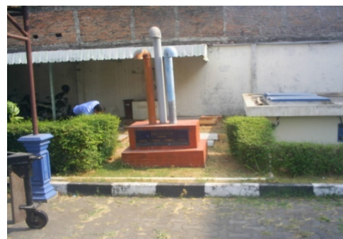
Fig. 1 Left: Office Building of Cirebon Water Supply Enterprise (PDAM Kota Cirebon); Right: Installed gappei Johkasou system