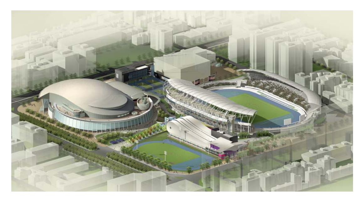
Figure 2 Sports Complex for the 21<sup>st</sup> Summer Deaflympics, 2009